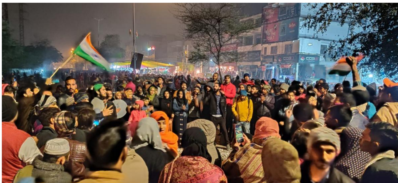
Students and local residents at the continuous sit-in protest at Shaheen Bagh

The demonstration at Shaheen Bagh may continue for a while more. As may also the other similar demonstrations across the country that involve Muslim “homemakers” and “housewives.” No matter what the future holds concerning the legal machinations of the political beasts, one can be certain that any number of “ordinary” Muslim women will continue to think and act differently, often, we can expect, much to the consternation of the males of the community. At Shaheen Bagh, a so-called maulana was turned away when he tried to adopt some posture of leadership, and in Kanpur, the women sitting on a similar dharna in Chamangunj flatly refused to listen to the two Qazis of the city who had come to dissuade them, and sent them packing. In Lucknow, a Shi’ah cleric has called for an end to the demonstrations against the Citizenship Amendment Act (CAA), but apparently has not been listened to and the demonstration by women at Husainabad has continued.